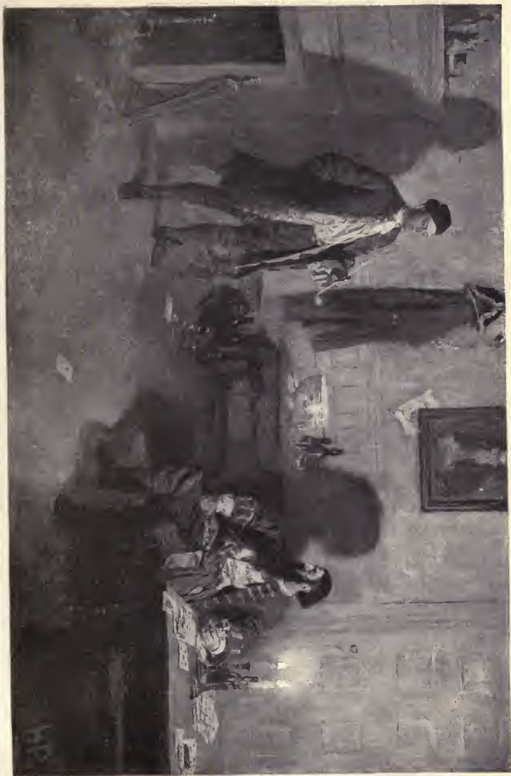
“MR. PARKER STOOD LOOKING STEADILY AT HIS VISITOR.”